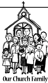
Our Church Family